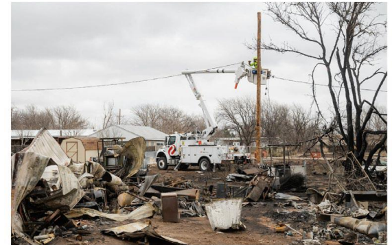
Workers replaced power lines that the Smokehouse Creek Fire damaged last month in Fritch, Texas.