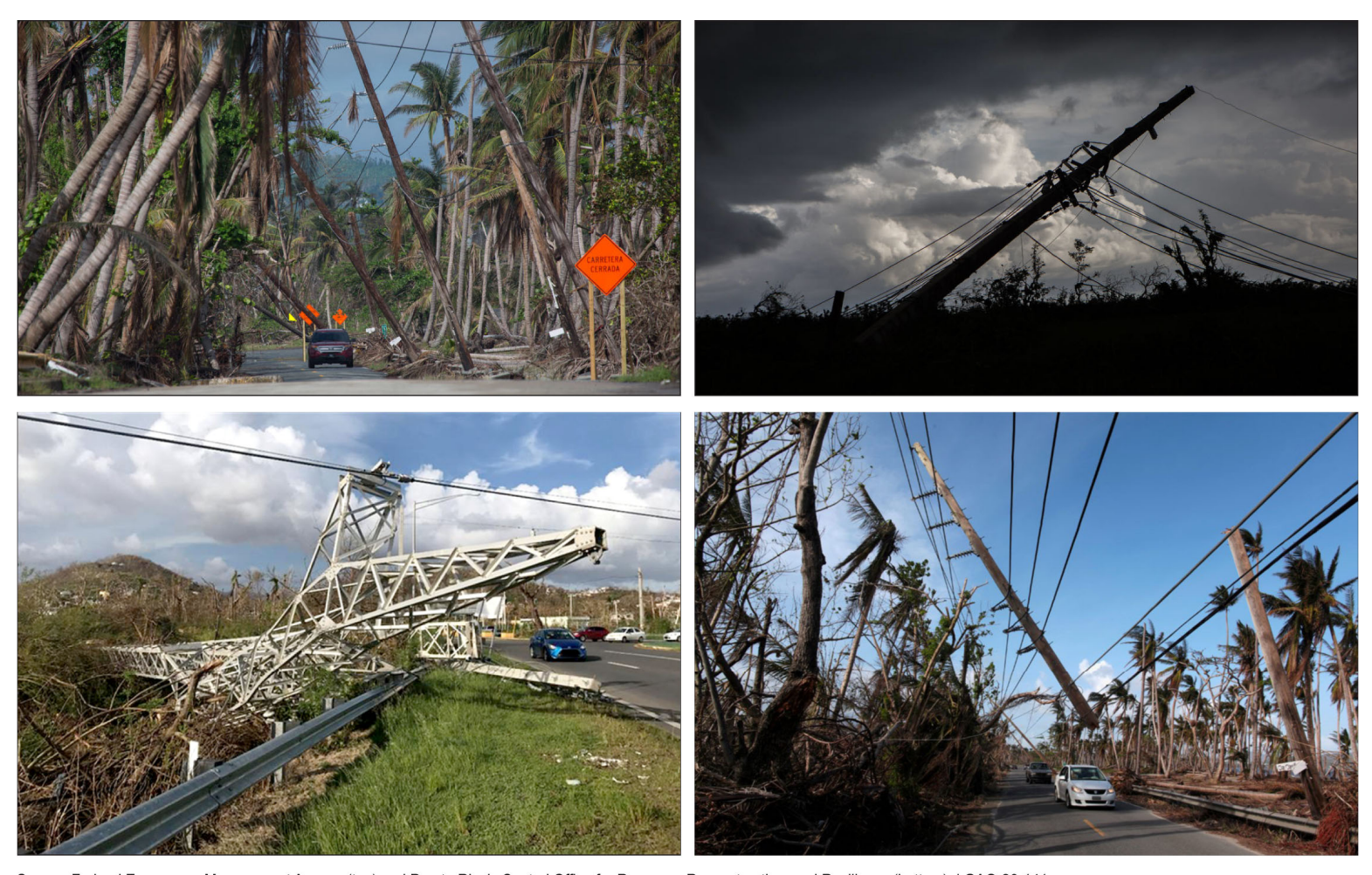
Source: Federal Emergency Management Agency (top) and Puerto Rico's Central Office for Recovery, Reconstruction, and Resiliency (bottom). | GAO-20-141